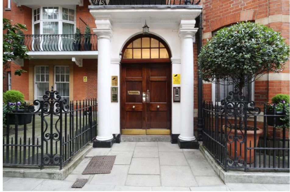
LCP House, Ogle Street, London W1W 6HU sales@lcpprivate.com 020 7723 1733