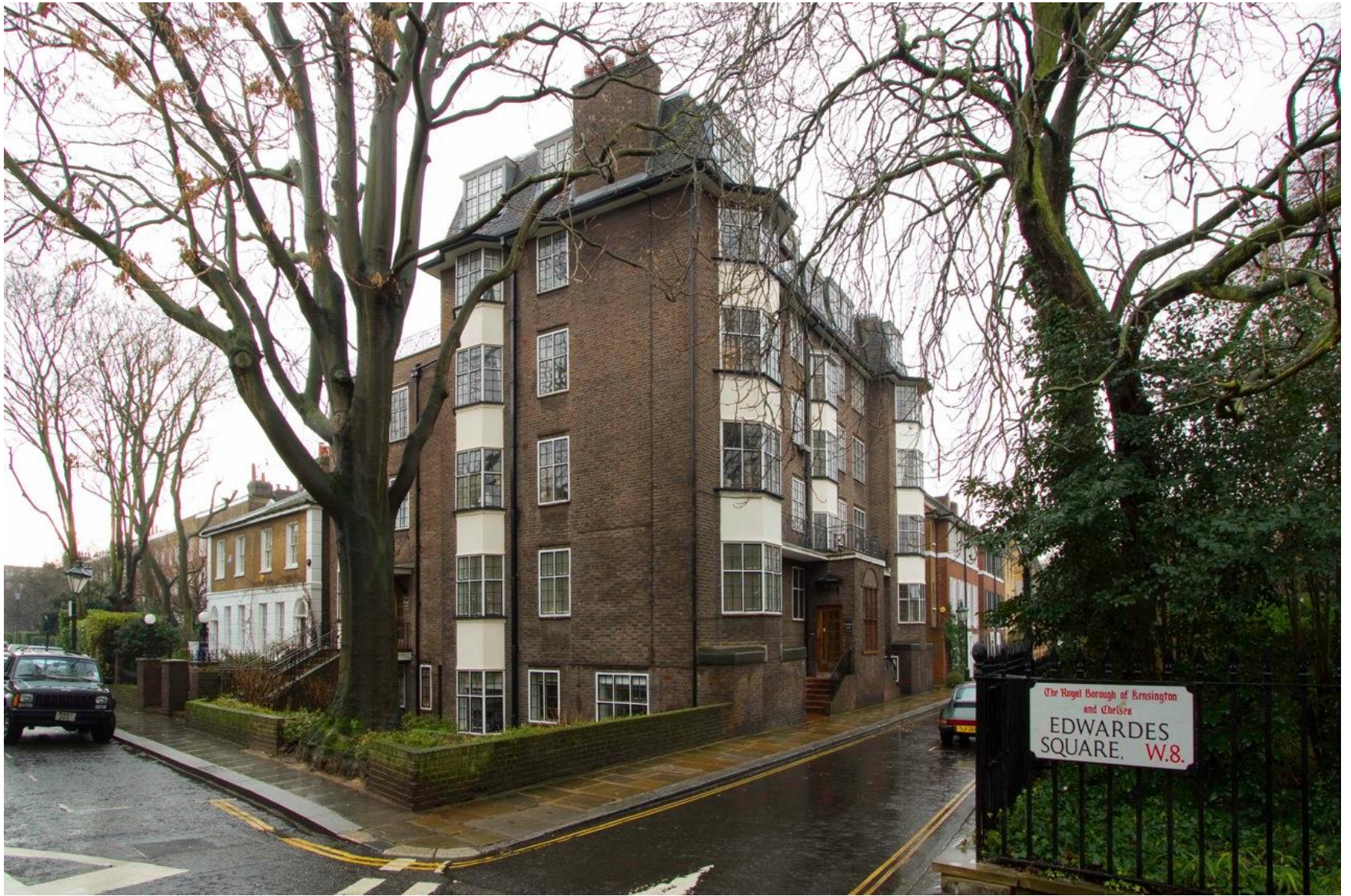
LCP House, Ogle Street, London W1W 6HU sales@lcprivate.com 020 7723 1733