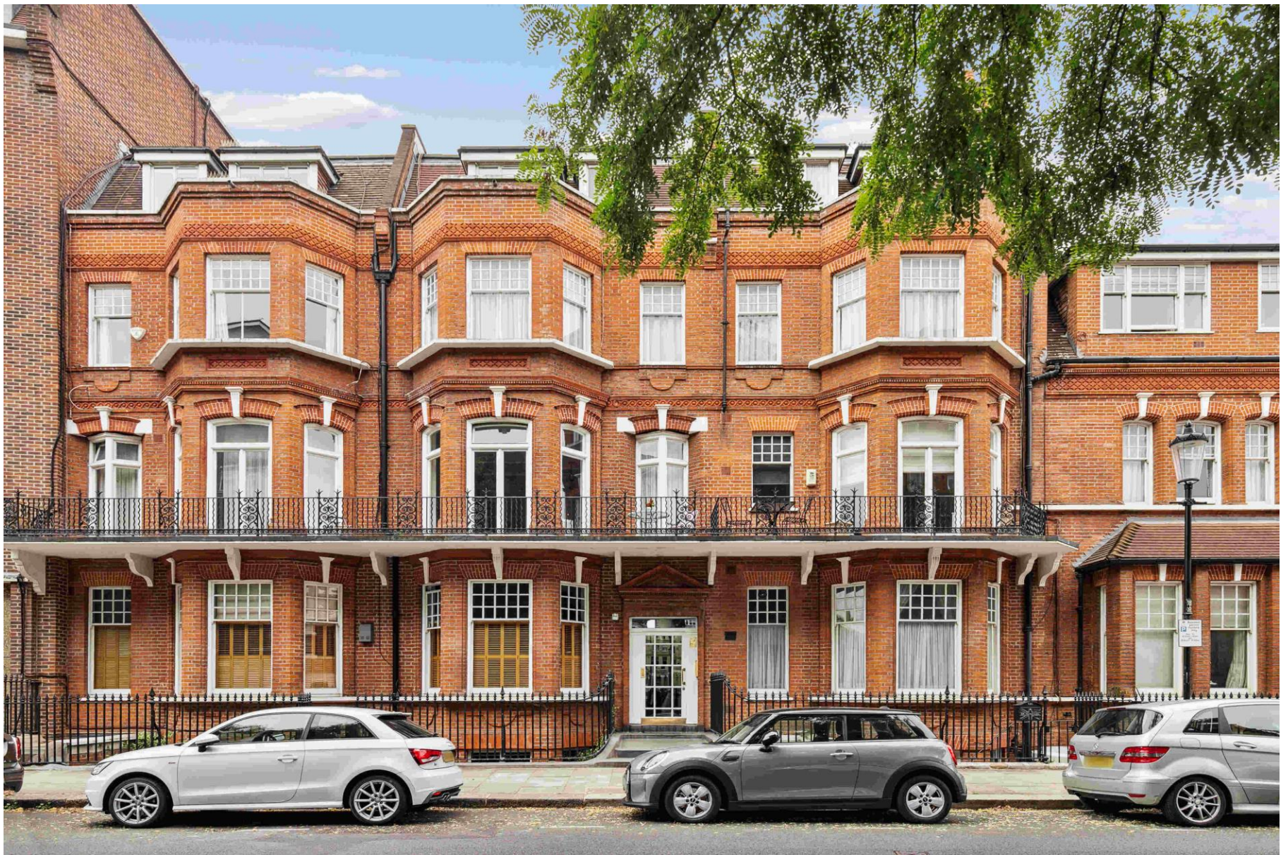
LCP House, Ogle Street, London W1W 6HU sales@lcpprivate.com 020 7723 1733