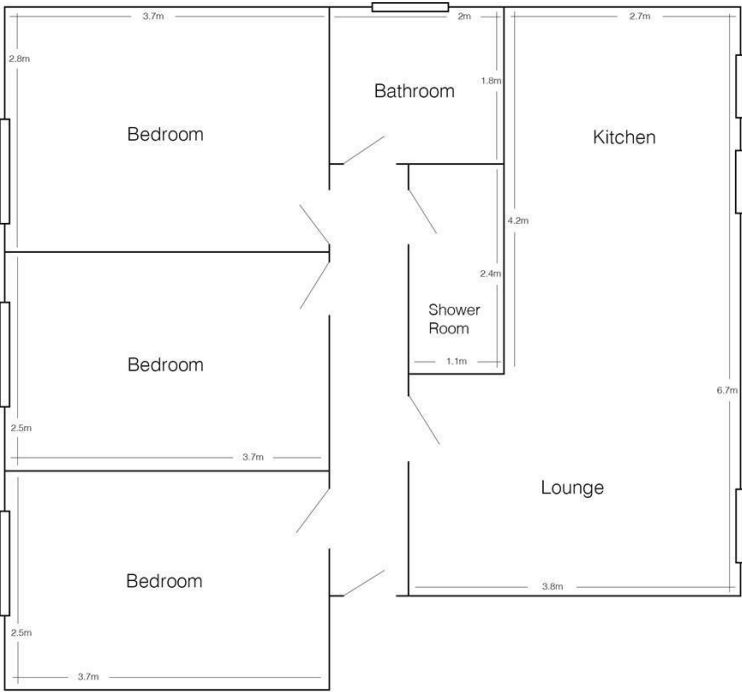
8 Headingley Rise (drawing not to scale)

This property was formally a 3 bedroom and is now being converted into a 2 bedroom. It will be ready to move in in July 2026 and will feature A large open plan lounge kitchen with modern integrated appliances and furnished with sofas. There will be a stylish wood floor throughout. There will also be a media wall with wall mounted smart TV. The double bedrooms will be furnished with large Ikea sofas and desks with chairs, there will also be a double bed. The bathroom will have a large walk in shower and vanity sink with drawers and w.c.. The picture are of some of our other recently refurbished places and will be updated when work is completed.