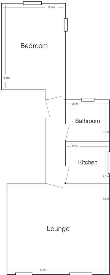
Flat 2, 12 Stanmore Road (drawing not to scale)