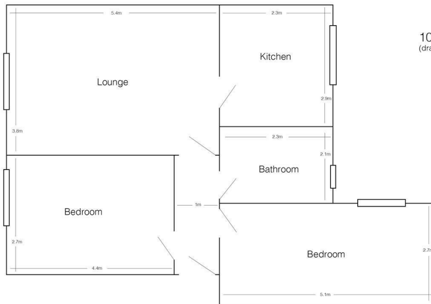
10 Headingley House (drawing not to scale)