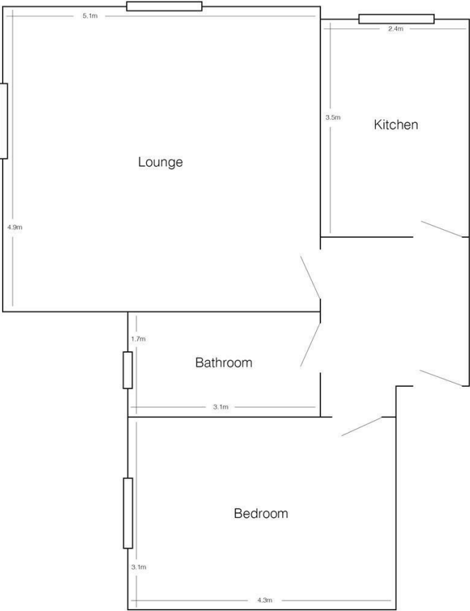
Flat 10, 62 Otley Road (drawing not to scale)

Additional amenities include off-street parking. The property is conveniently located just a short walk from Leeds Beckett University and is on the main bus route into Leeds City Centre.