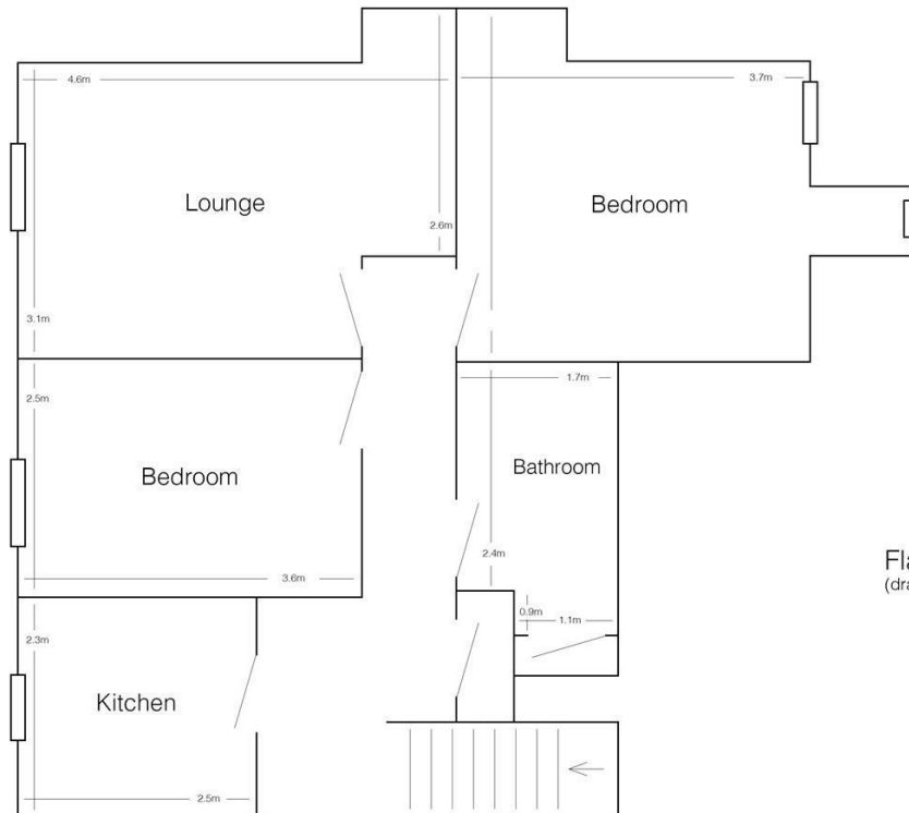
Flat 5, 15 Richmond Road (drawing not to scale)