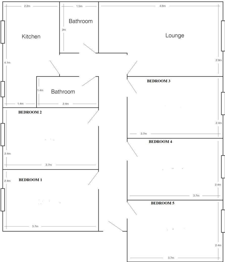
6 Headingley Rise (drawing not to scale)

2 Rooms Available in a student flat share. Rent of £102 per week included utility bills. Nice 5 bedroom apartment in a gated complex in central Hyde Park just off Brudenell Road. The apartment has 5 equal sized bedrooms with fitted wardrobe, desk and chest of drawers. There is also a bed and chair. The separate lounge is furnished with sofas. There are also 2 shower rooms. The kitchen is fitted with modern units and has integrated oven and hob and freestanding washing machine and fridge freezer. The flat is double glazed and gas central heated. You can rent this property with utility bills included for only £102 per person per week.