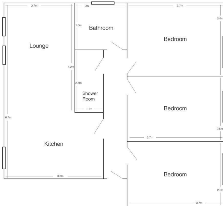
7 Headingley Rise (drawing not to scale)

Modern flat in purpose built block with parking and close to local shops in central Hyde Park. Open plan lounge with sofa`s, modern fitted kitchen. 3 good sized double bedrooms furnished with double bed, large wardrobe, chest of drawers, desk and chair. fully tiled bathroom with bath and separate shower room. double glazed and gas central heated throughout. YOU CAN RENT THIS PROPERTY WITH BILLS INCLUDED FOR A TOTAL OF £128 PER PERSON PER WEEK