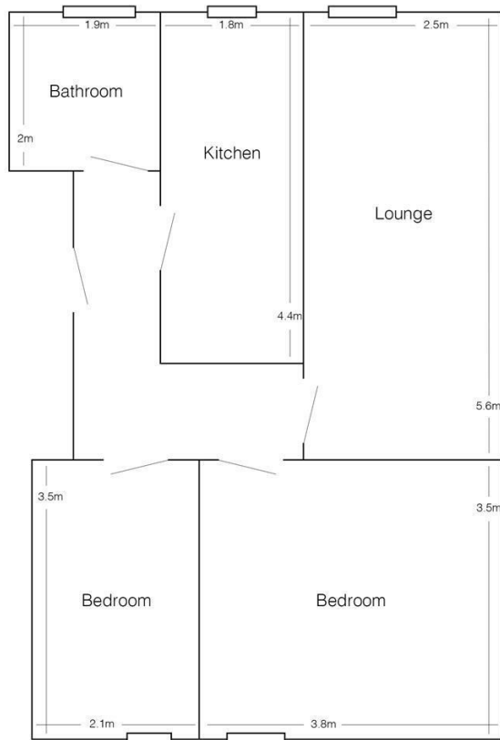
Flat 4, 21 Midland Road (drawing not to scale)