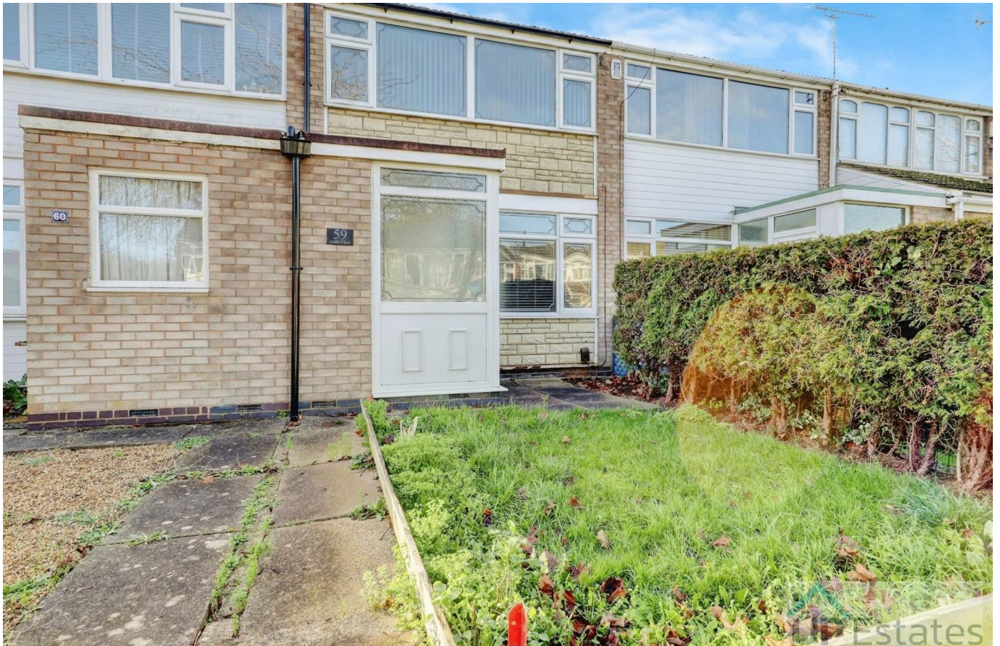
Ashby Close, Binley, Coventry