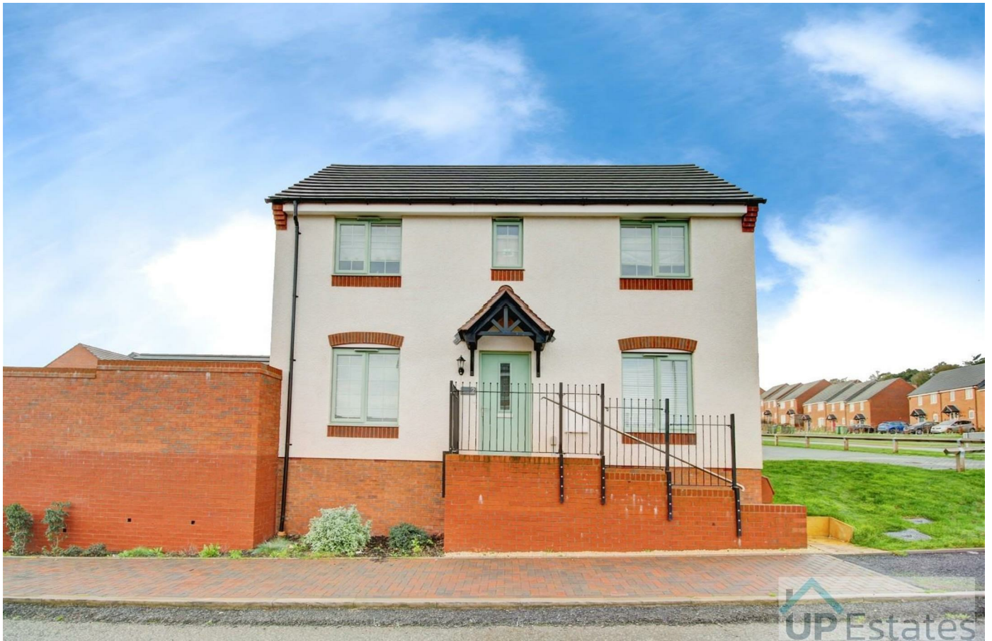
Roger Blythebrook Avenue, Keresley End, Coventry