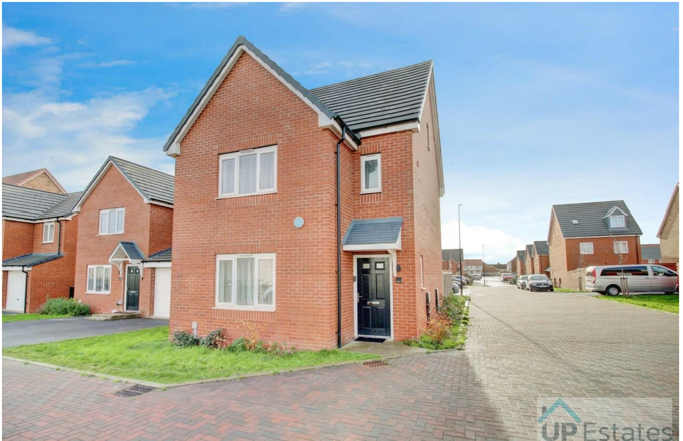
Meggitt Avenue, Coventry