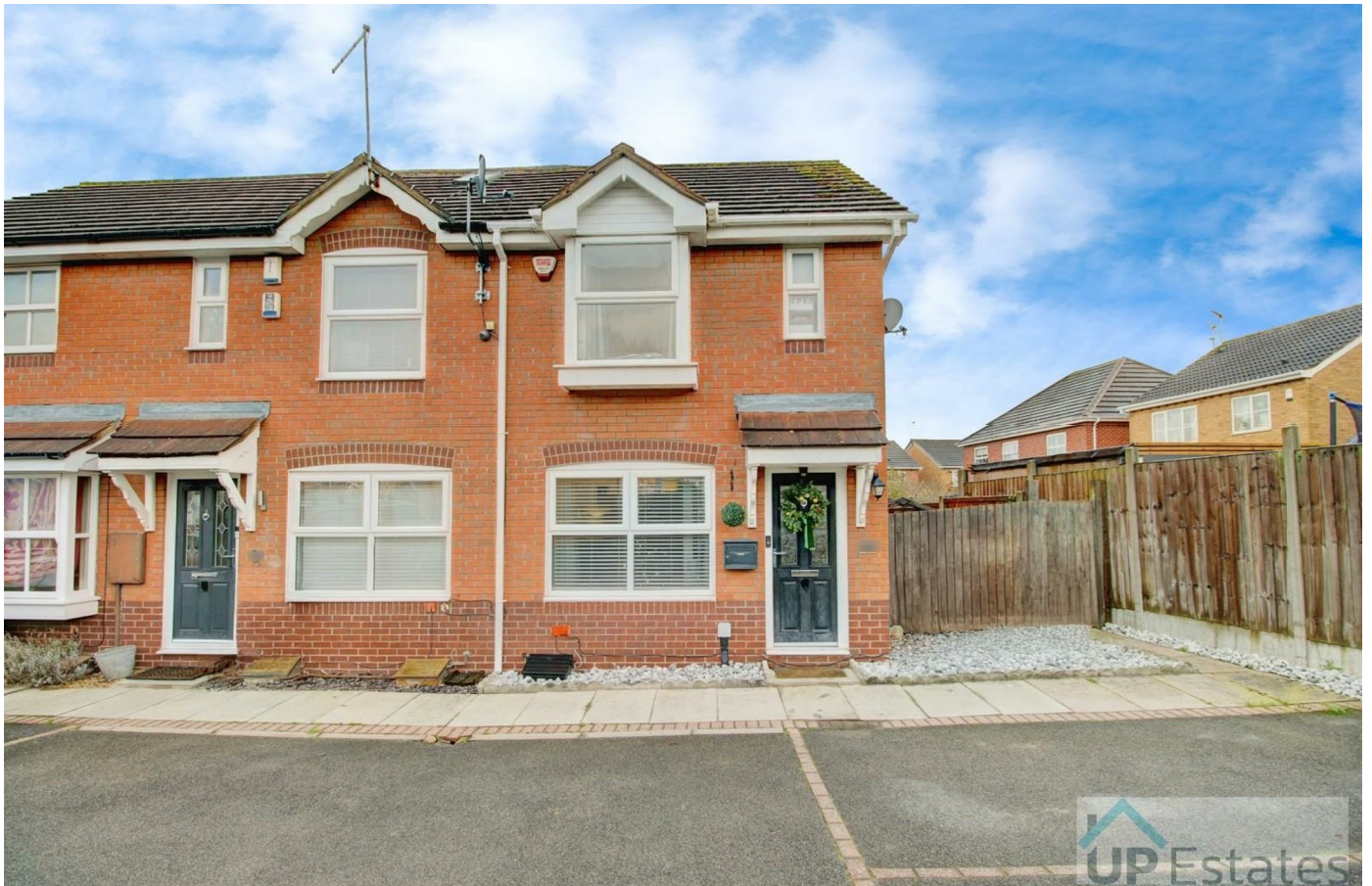
Tideswell Close, Binley, Coventry