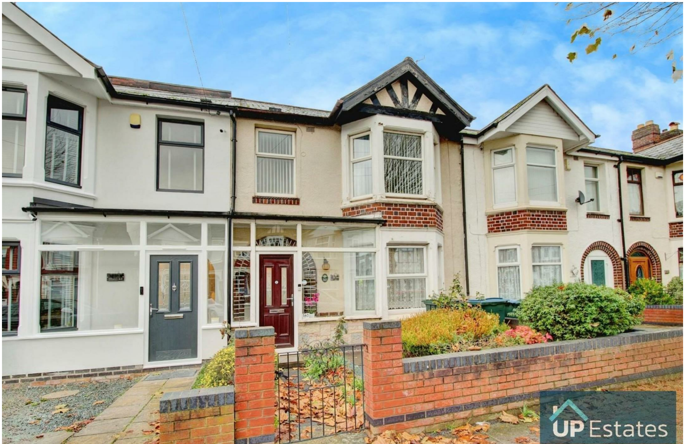
Siddeley Avenue, Coventry