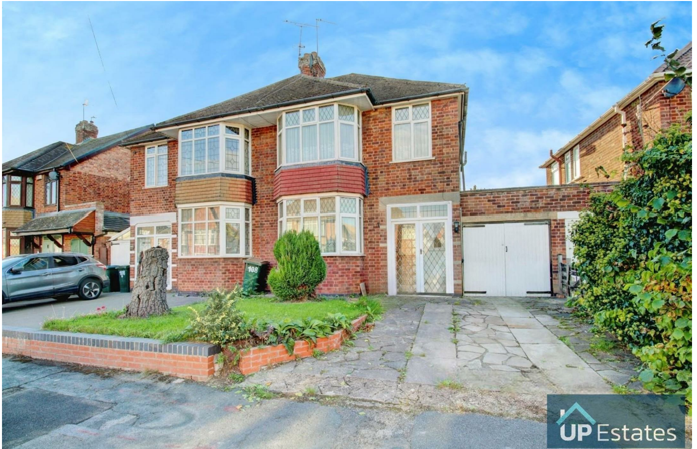
Arnold Avenue, Coventry