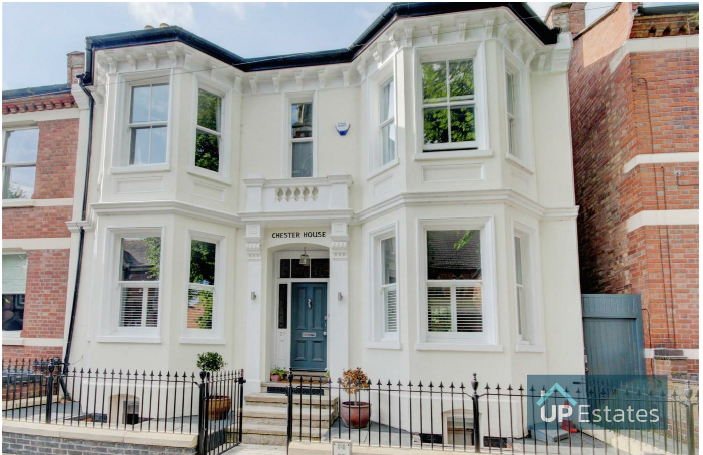
Leicester Street, Leamington Spa