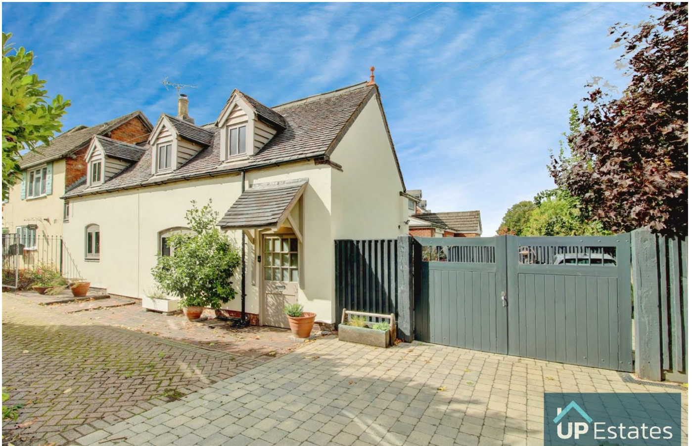
Binley Road, Binley, Coventry