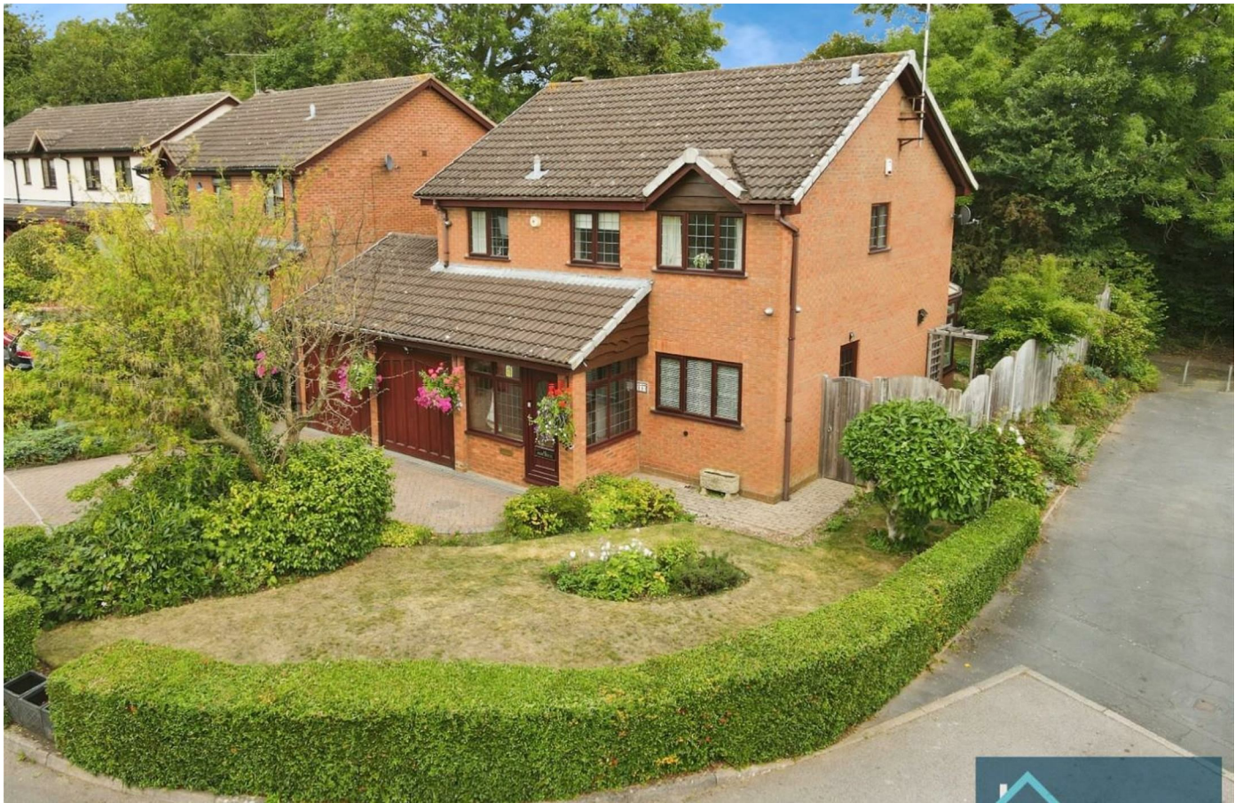
High Beech, Coventry