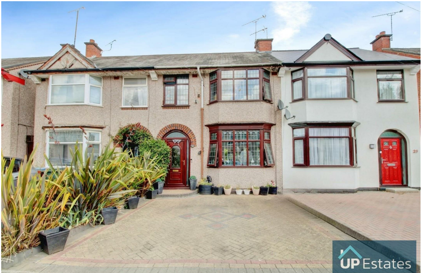
Glencoe Road, Coventry