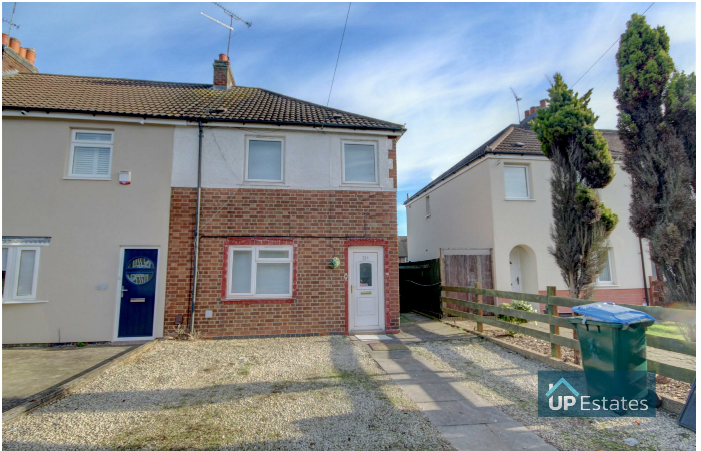
Beake Avenue, Coventry