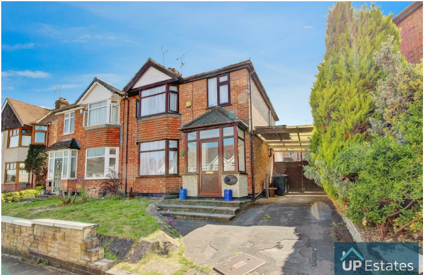
Lincroft Crescent, Coventry