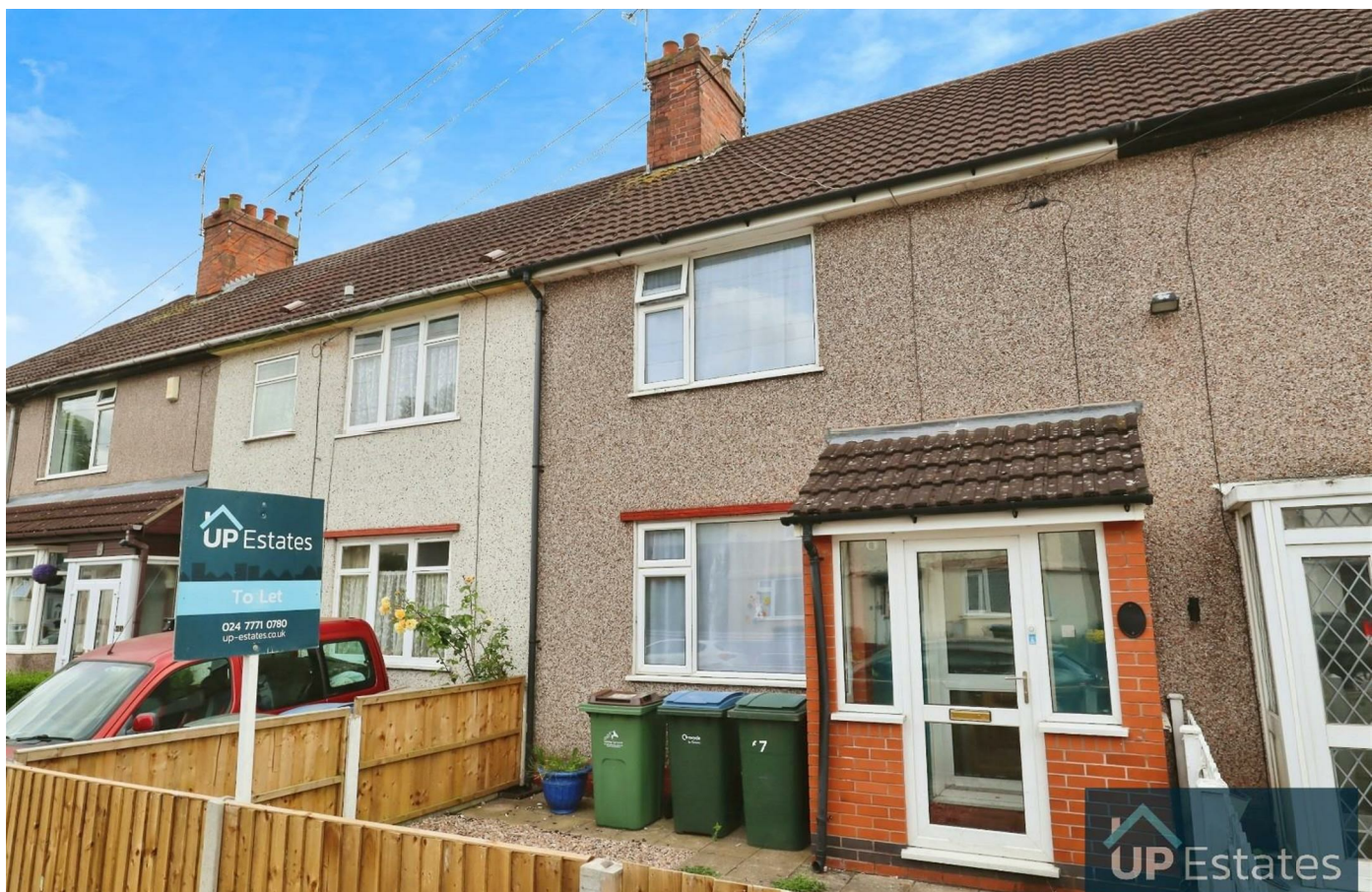
Dugdale Road, Coventry