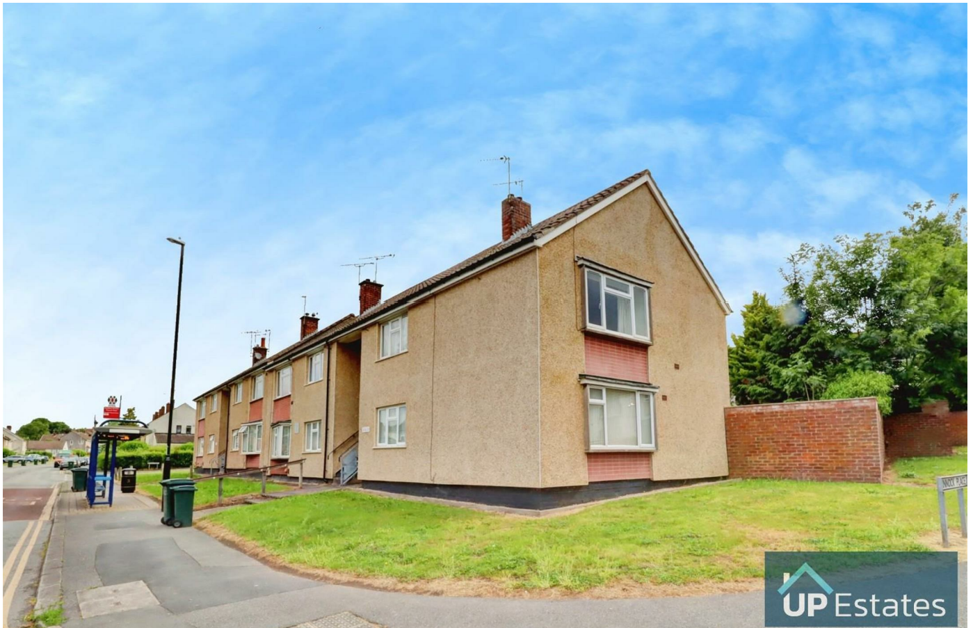
Bushberry Avenue, Coventry