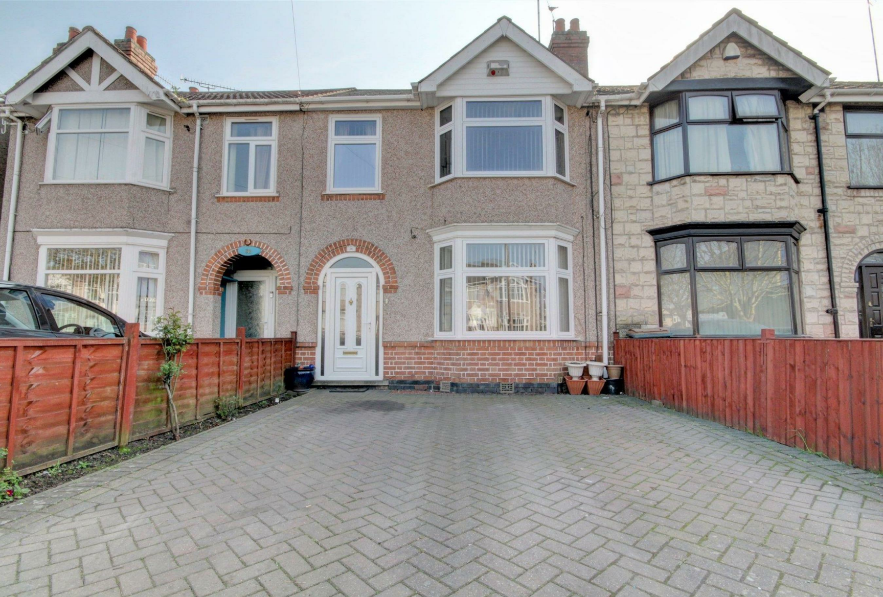
3 Bed House - Terraced located on Longfellow Road, Coventry £1,295 PCM