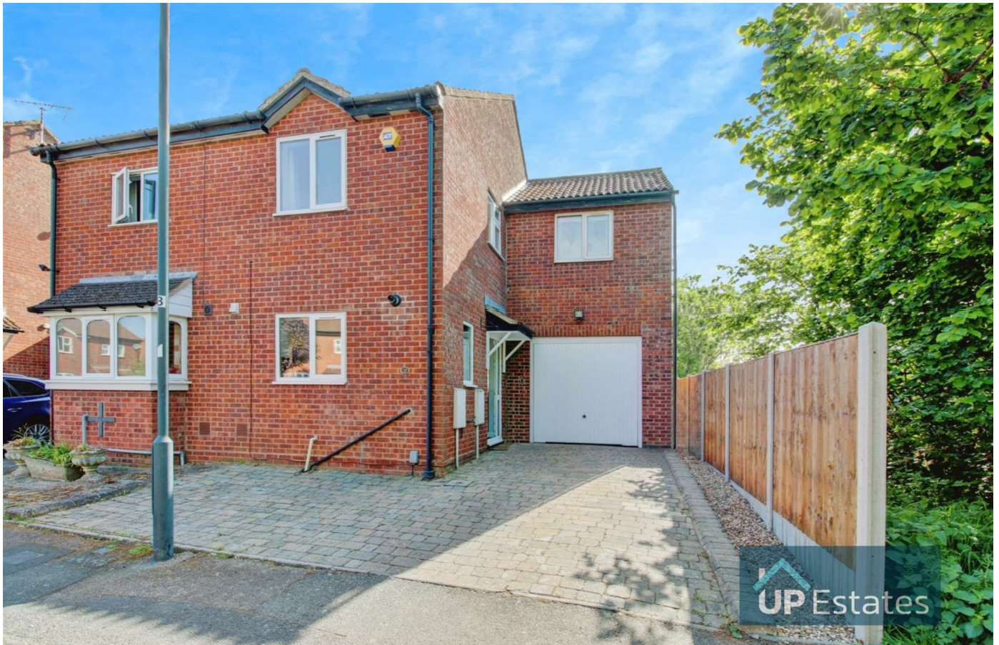
Moncrieff Drive, Leamington Spa