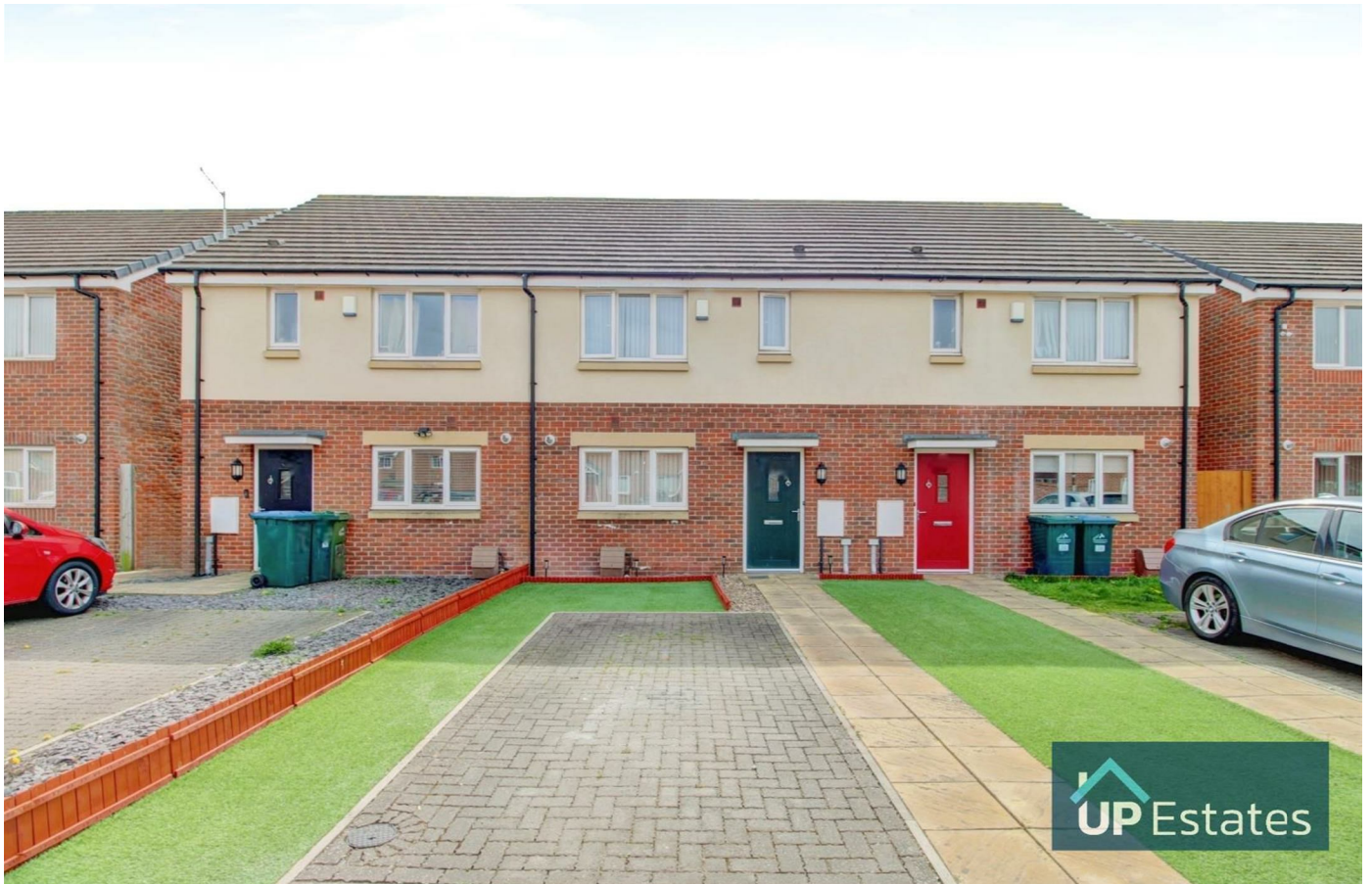
Mercia Gardens, Coventry