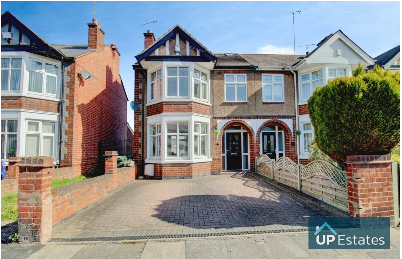
Kempley Avenue, Coventry