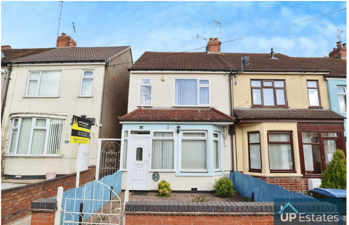
Elgar Road, Coventry