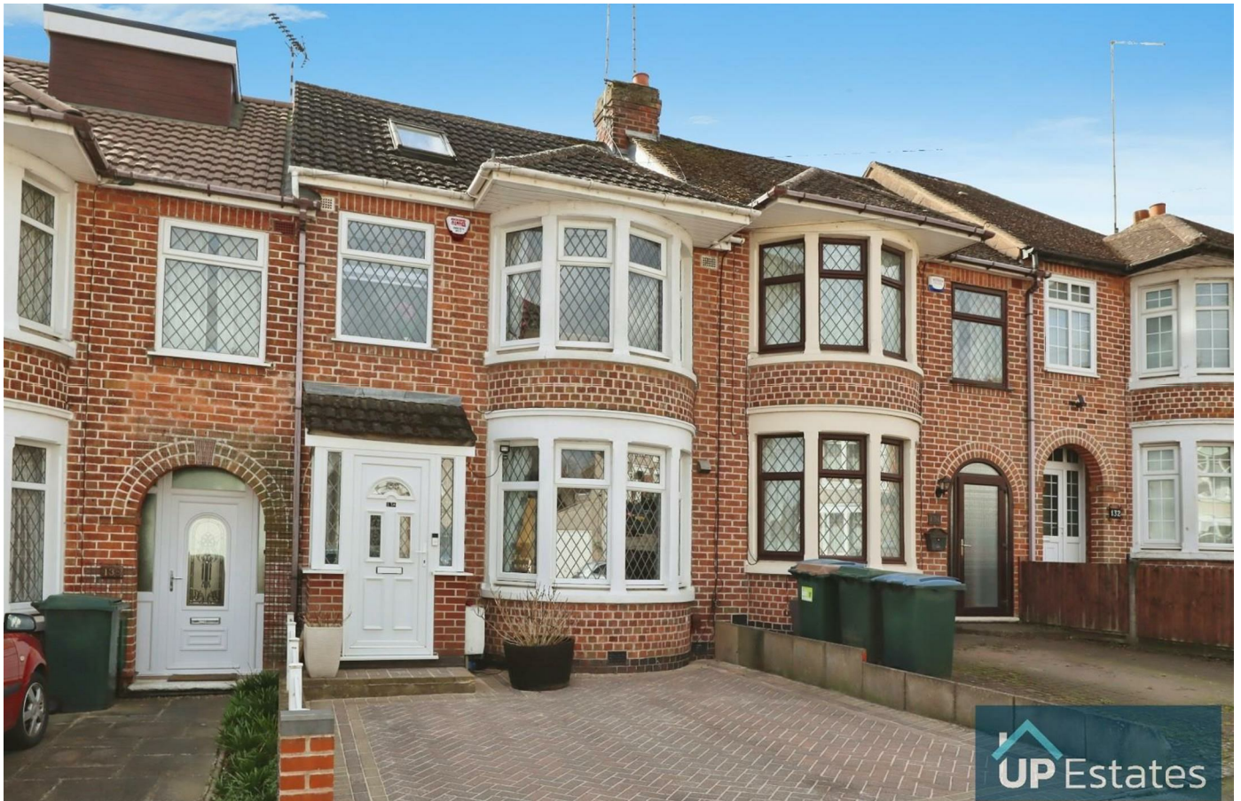
Ashington Grove, Coventry