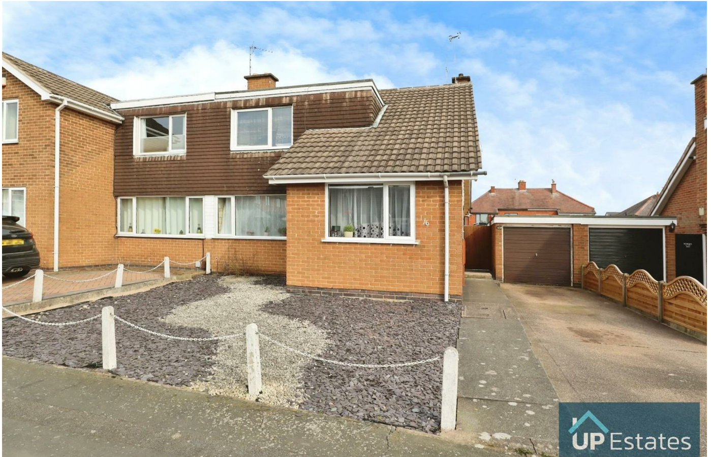
Claremont Drive, Ravenstone, Coalville