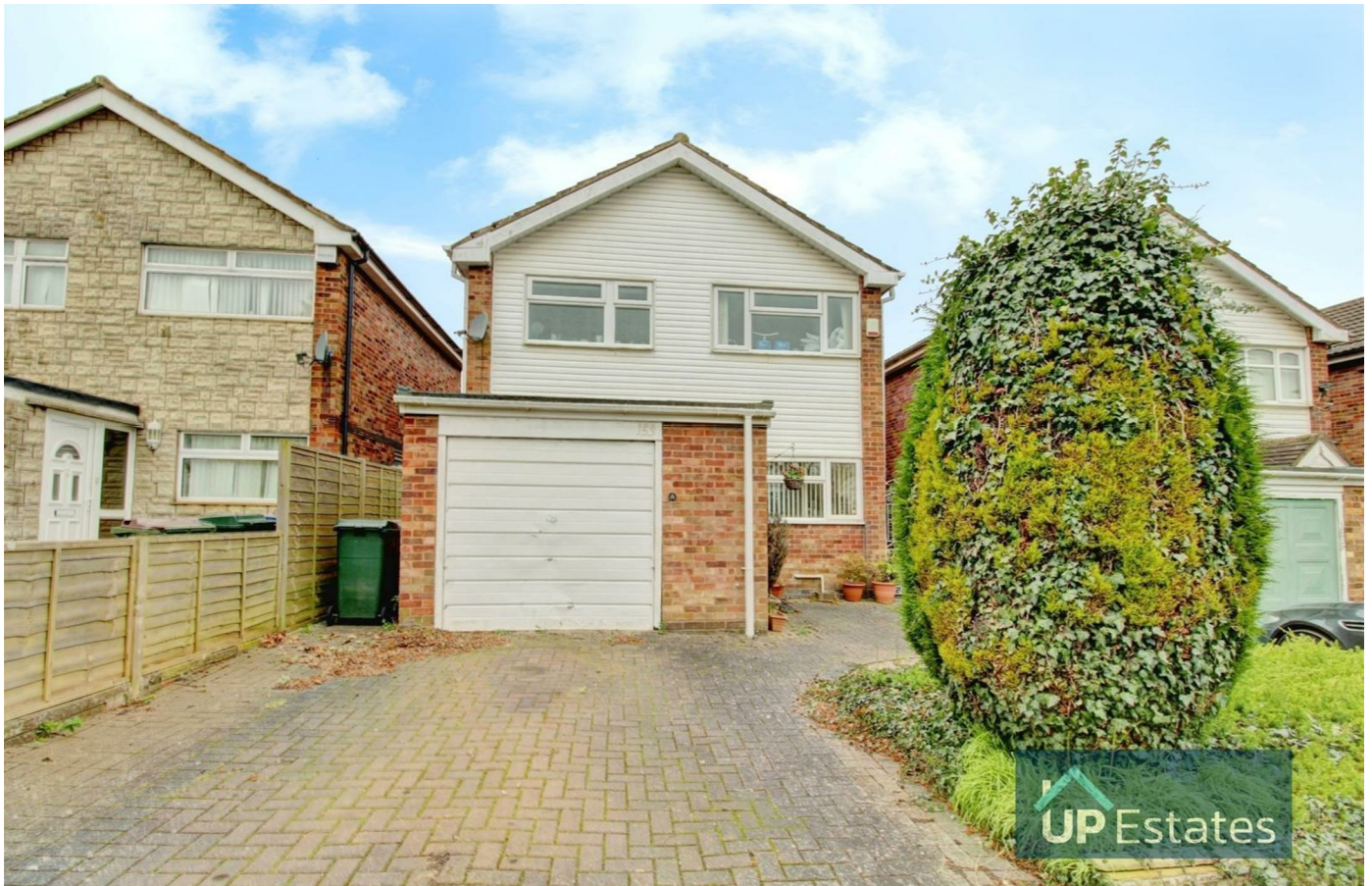
Coombe Park Road, Coventry