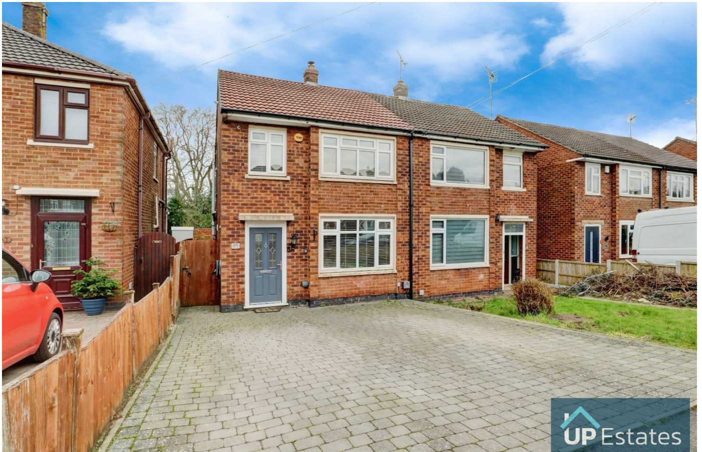
Deans Way, Coventry