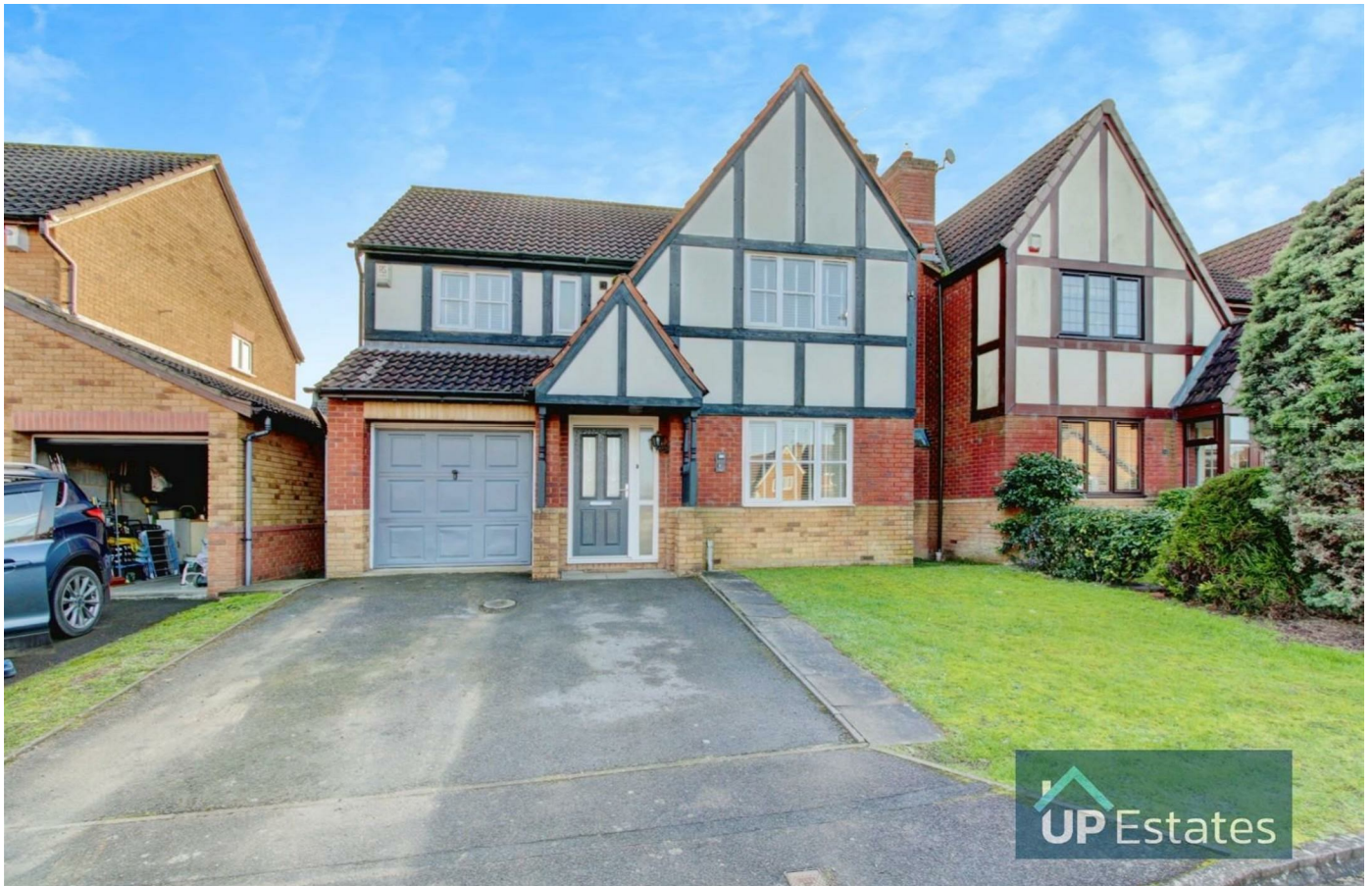
Dowley Croft, Binley, Coventry