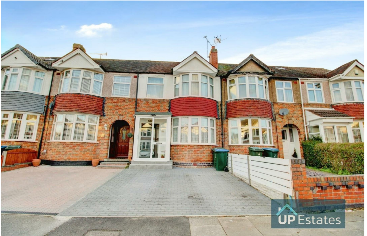
Macdonald Road, Coventry