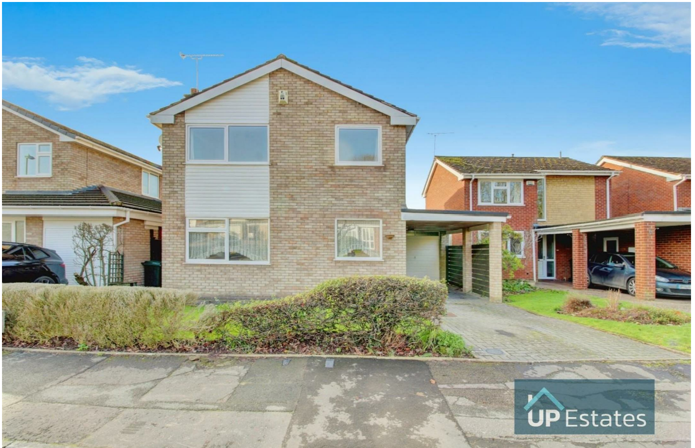
Jacklin Drive, Coventry