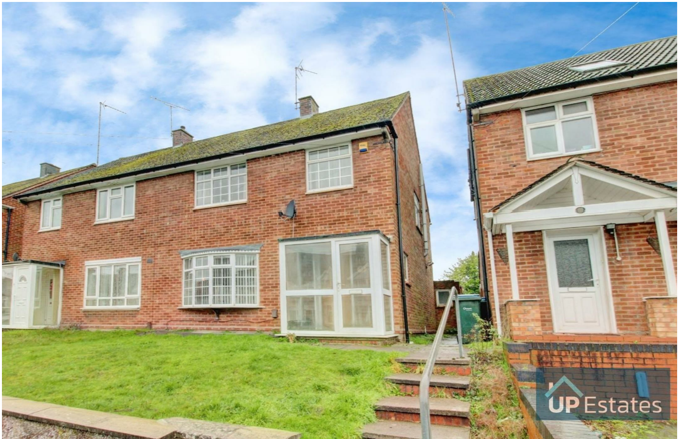
Macdonald Road, Coventry