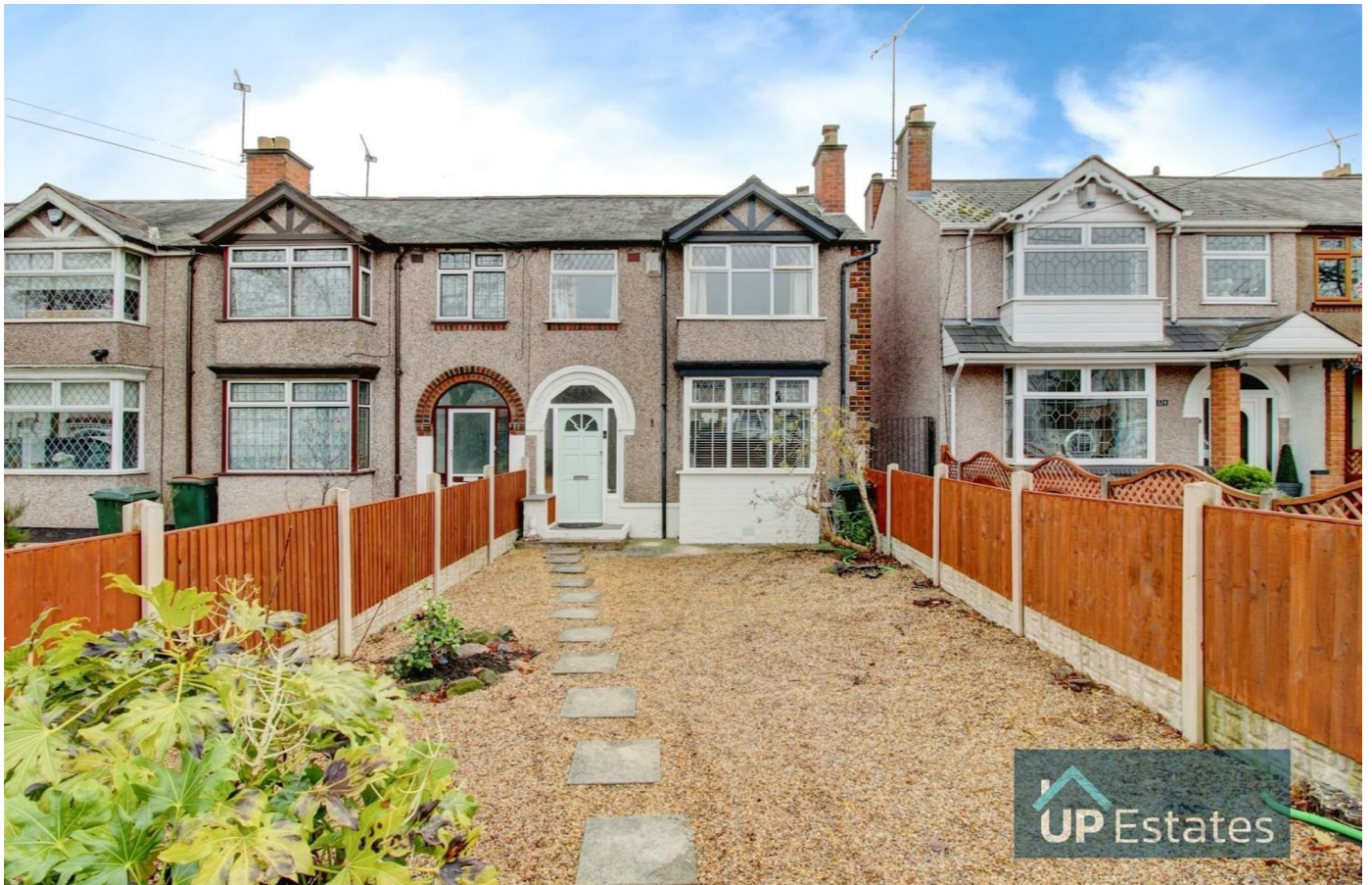
Ansty Road, Coventry