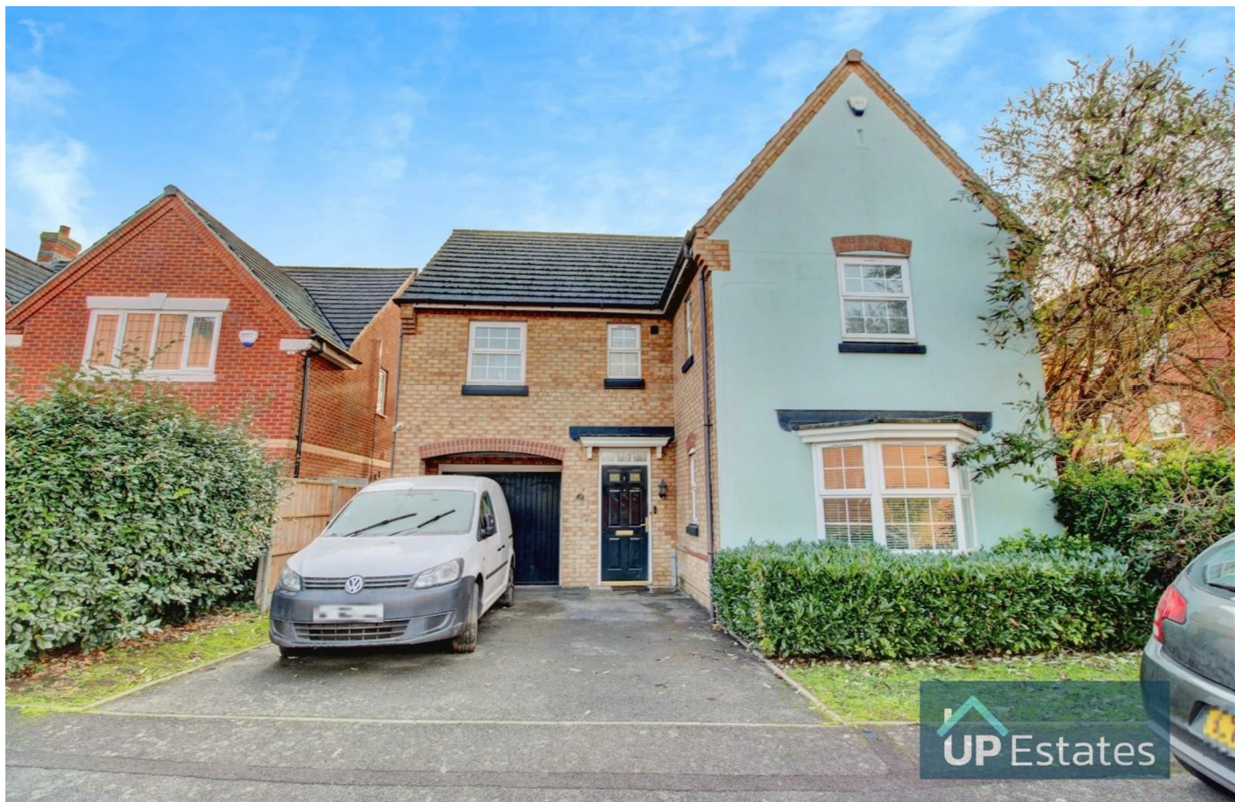
Valencia Road, Coventry