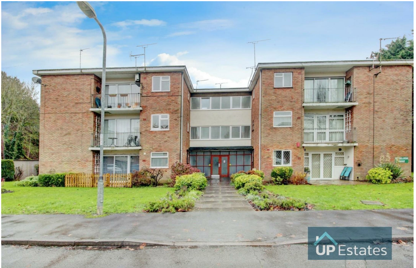
Woodlands Court, Binley Woods, Coventry