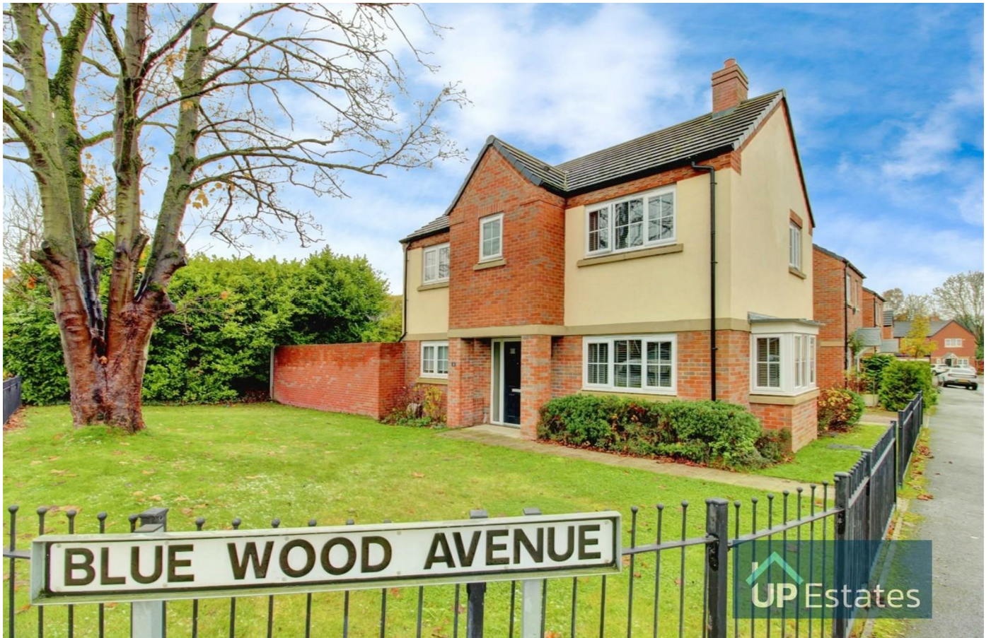
Blue Wood Avenue, Coventry