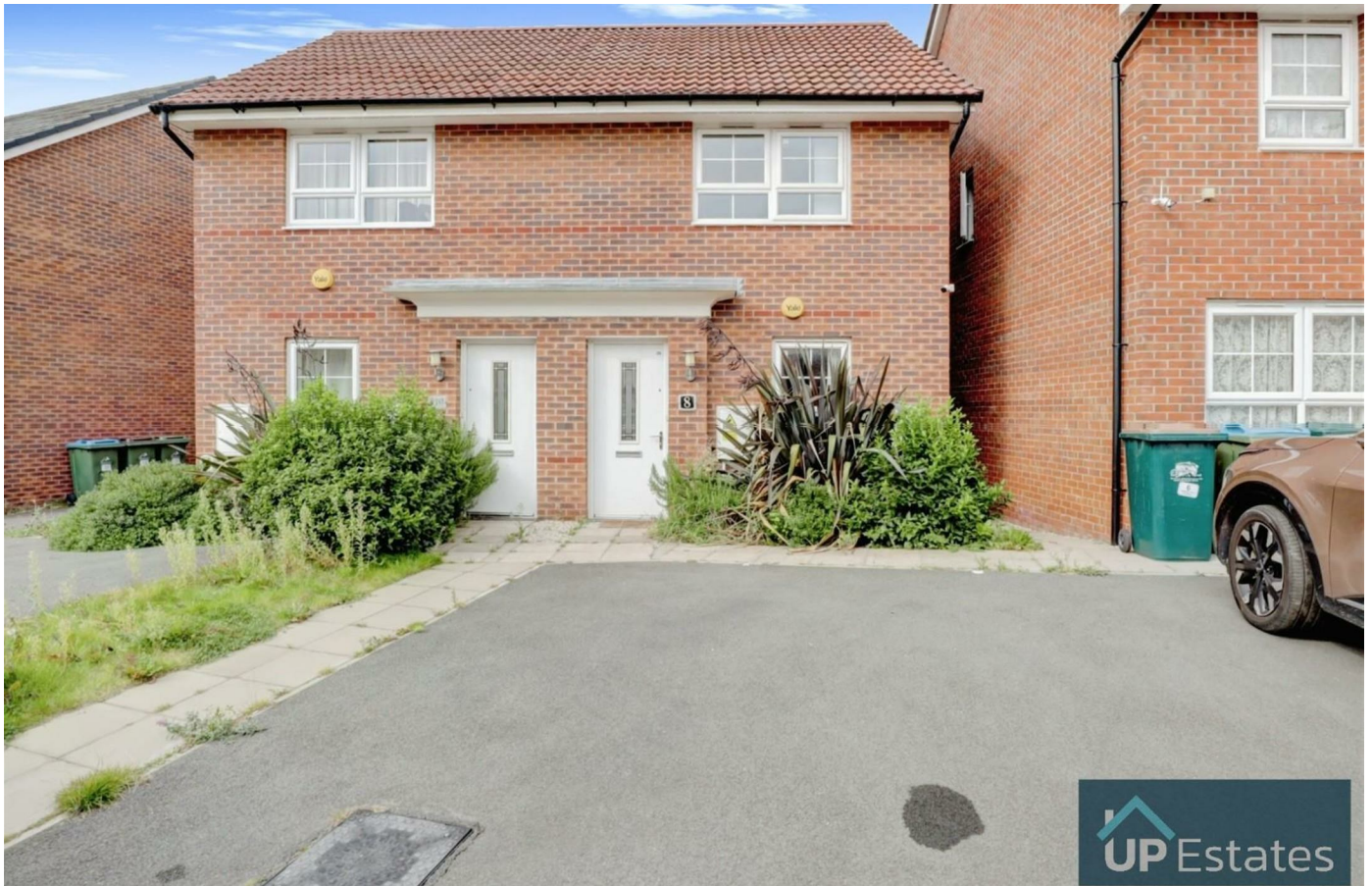
Lapwing Place, Coventry