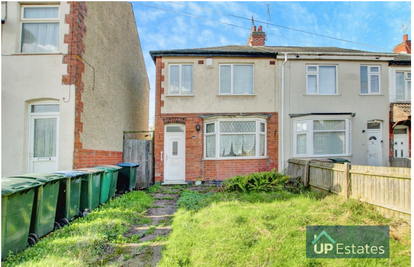
Pearson Avenue, Coventry