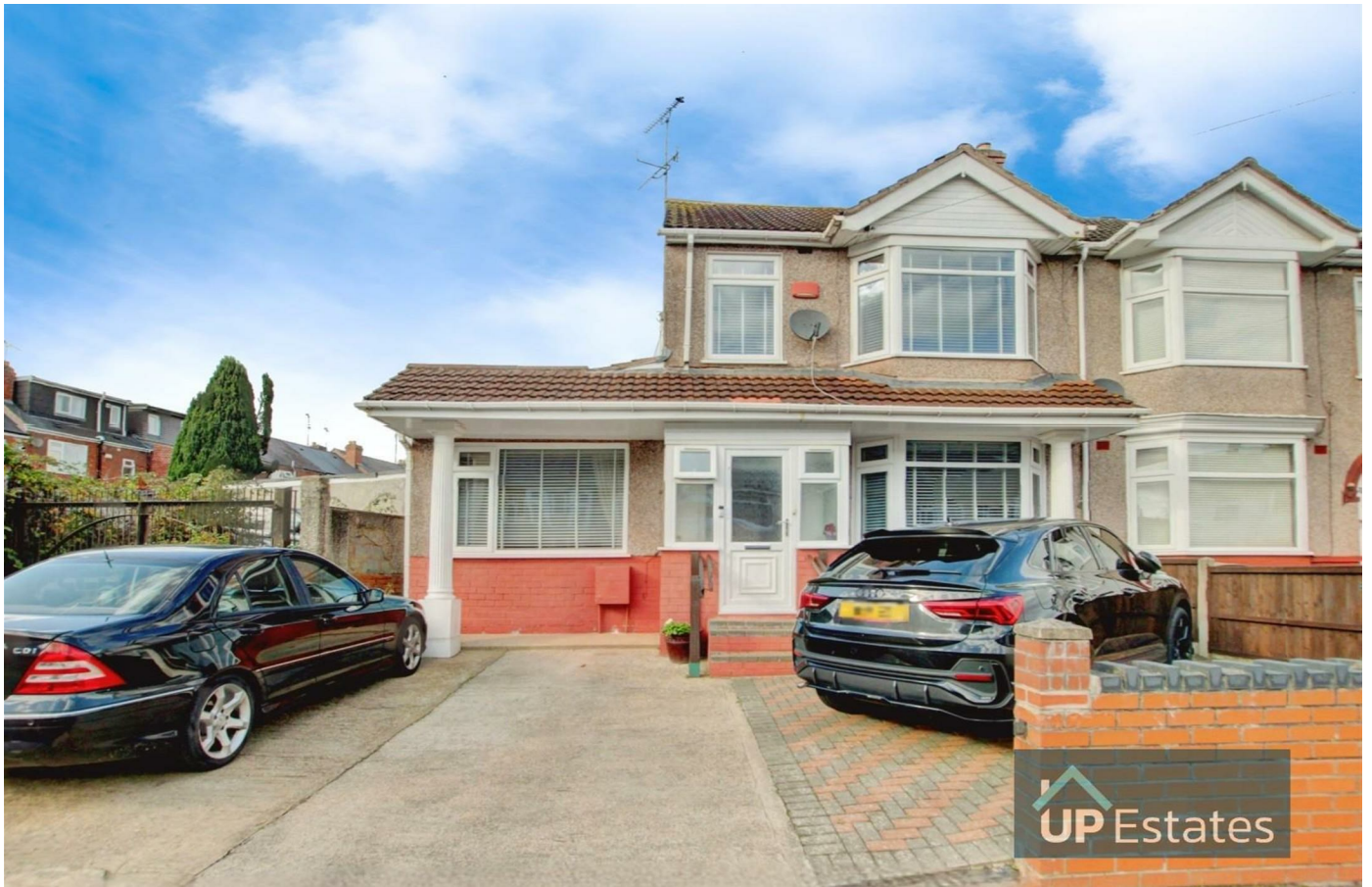
Hermitage Road, Coventry