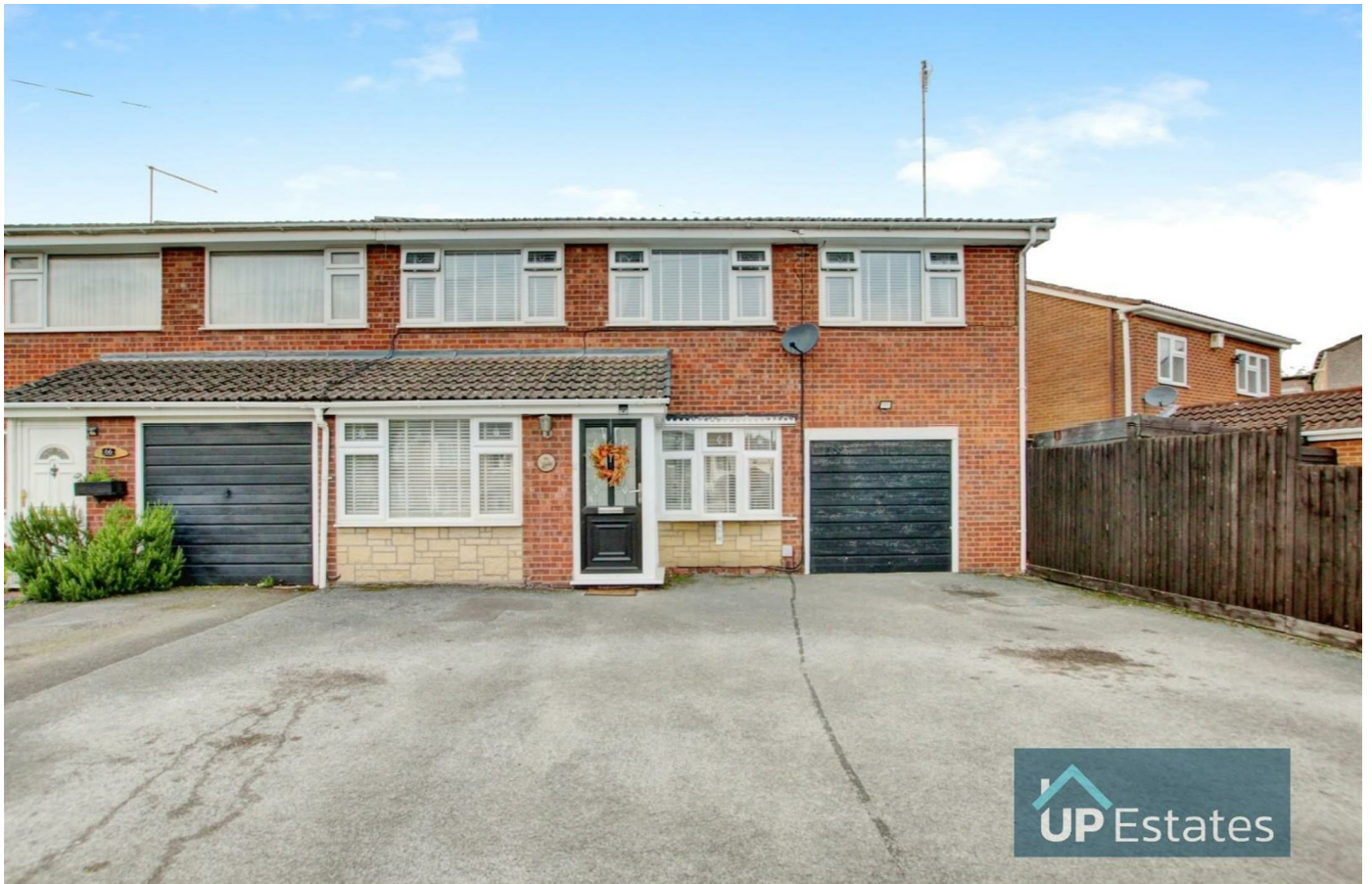
Bulls Head Lane, Coventry