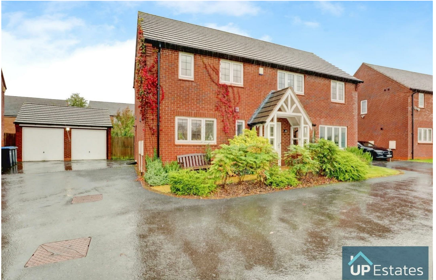
Dodgson Close, Cawston, Rugby