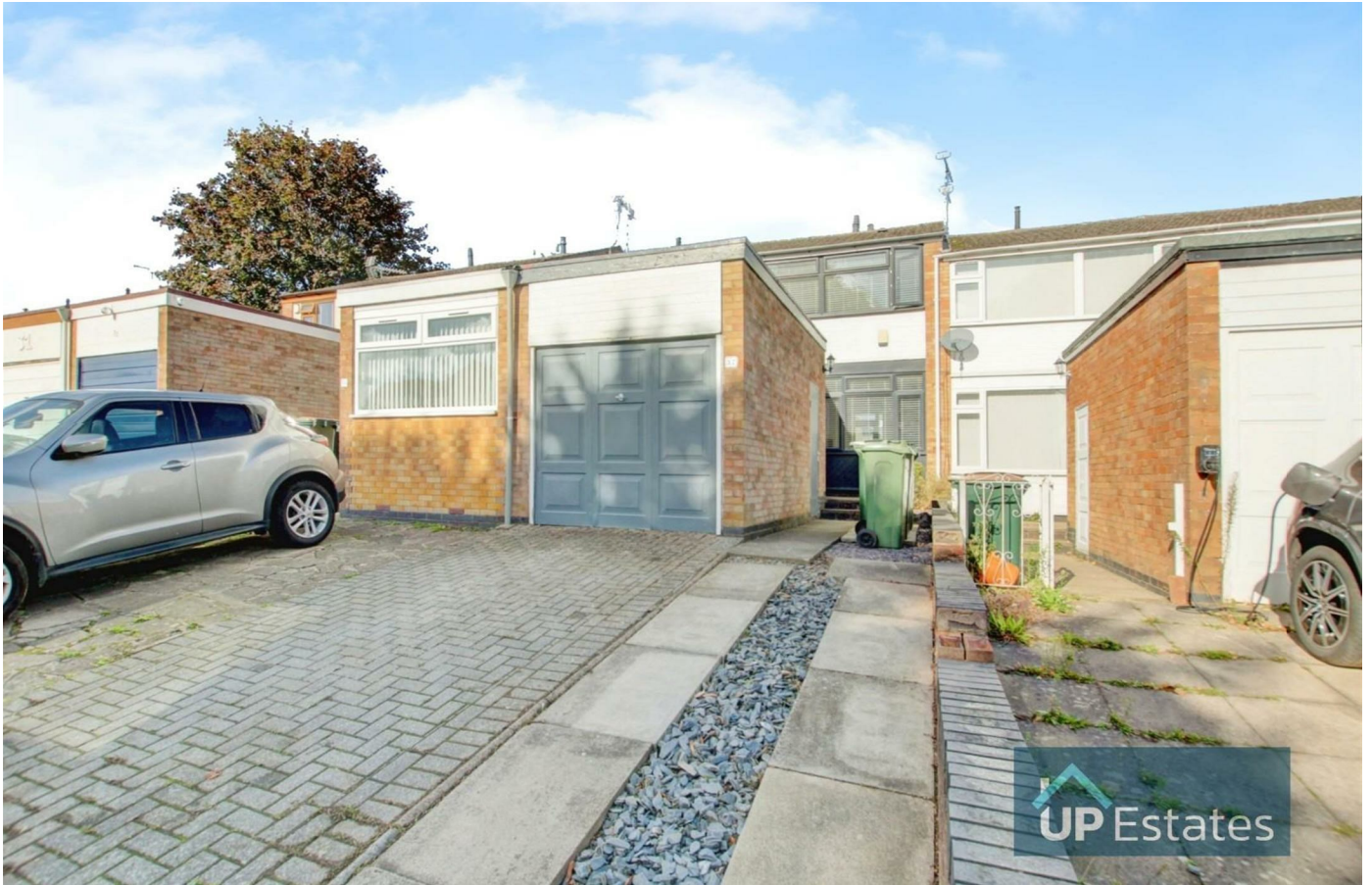
Bredon Avenue, Binley, Coventry