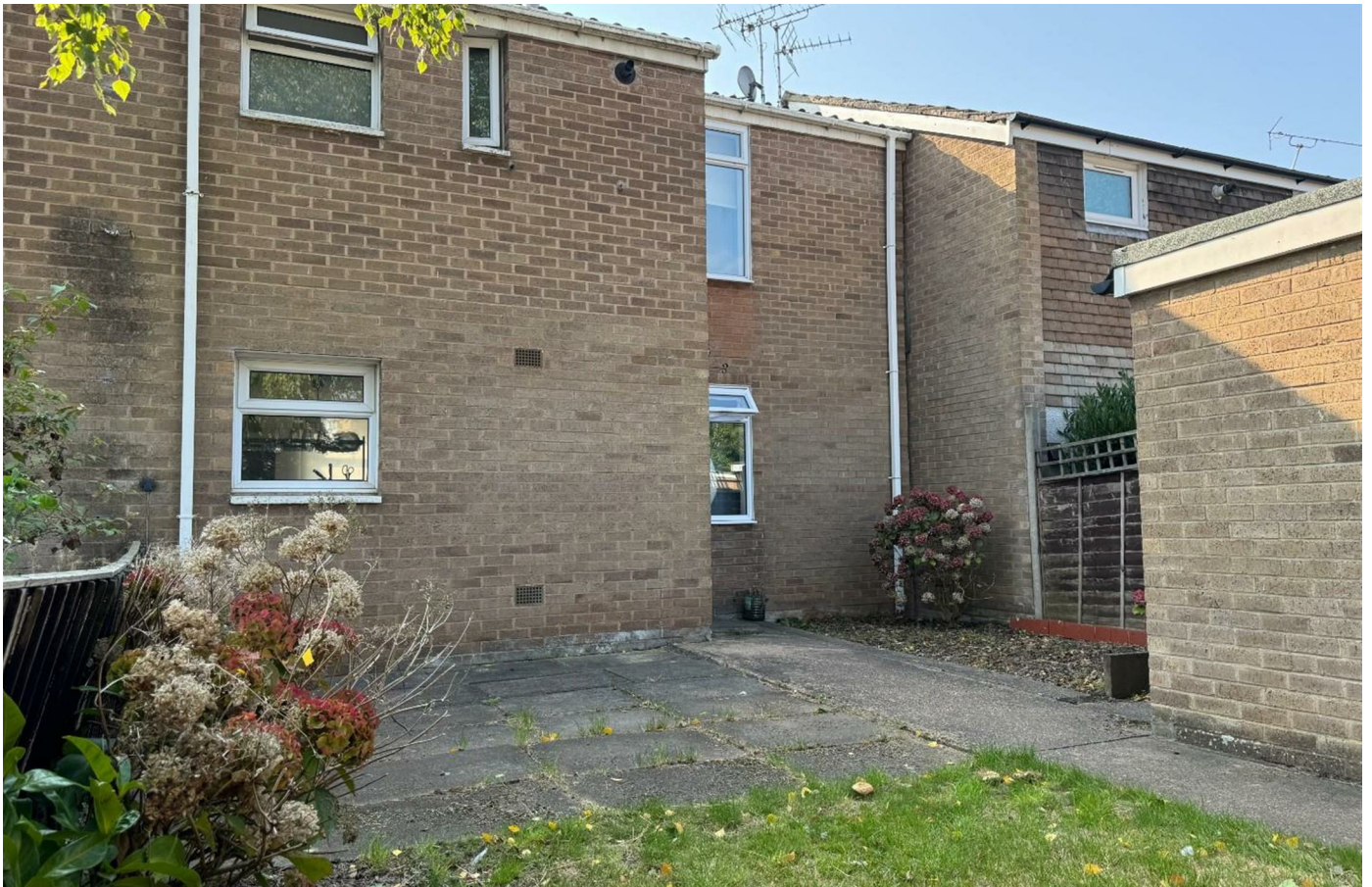
Agincourt Road, Coventry