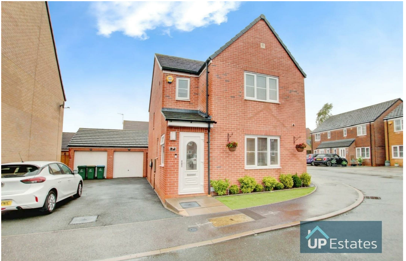
Claybrookes Lane, Binley, Coventry